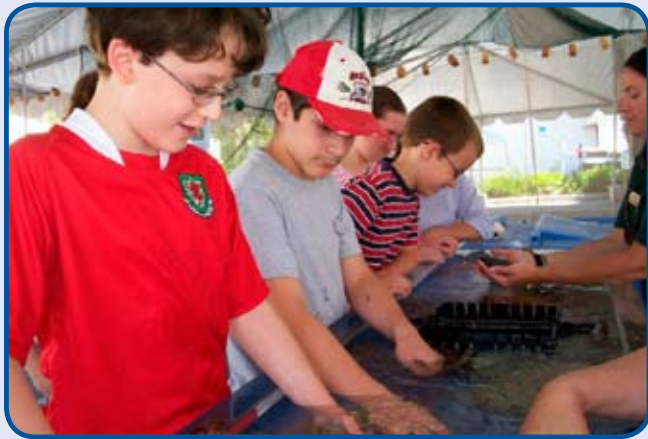
4-H members at touch tank