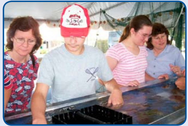
4-H members and chaperones at touch tank