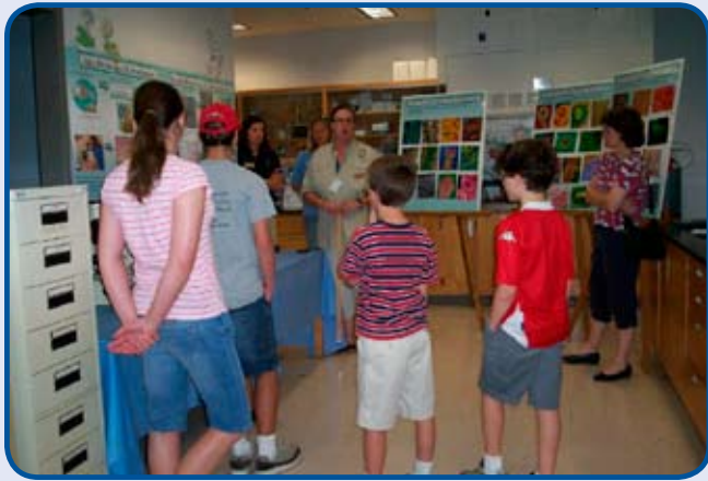
Listening to a lecture