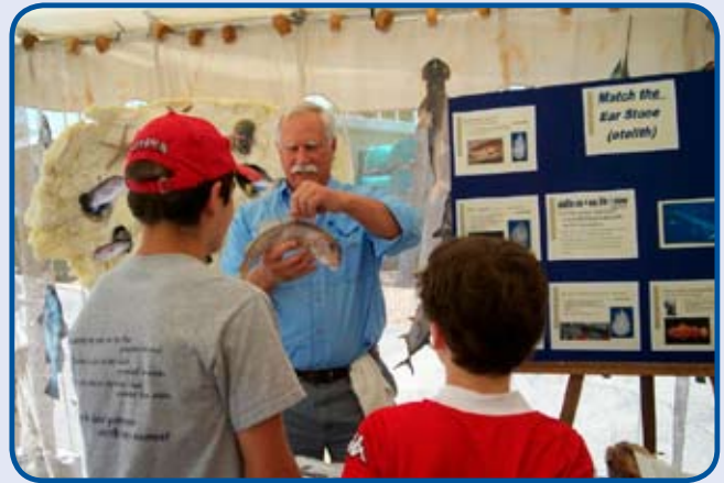
Looking at a fish