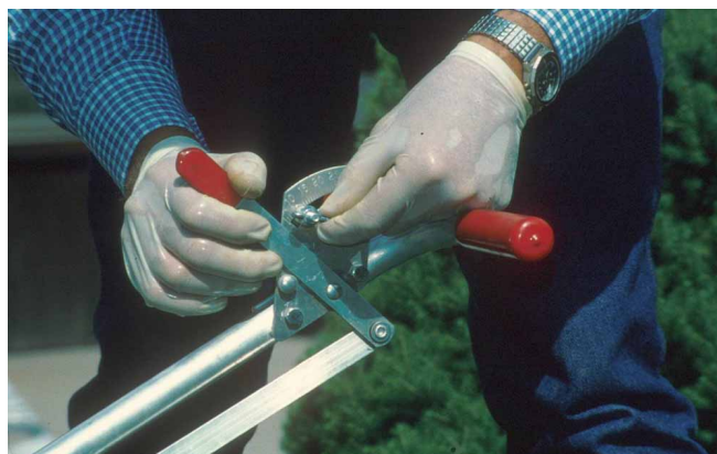
Figure 5. Granular applicator settings are often listed on product labels for correct delivery rates.