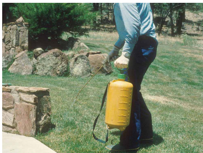
Figure 4. A hand-pump sprayer is commonly used to deliver pesticide diluted in water around lawn and garden.

Many of the product labels for granular products include a table with a listing of settings that are specific for popular granular lawn spreaders (Figure 5).