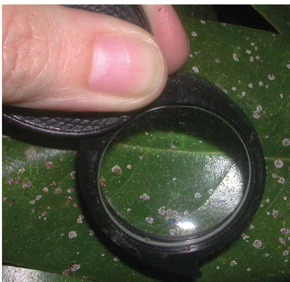
Figure 2. Accurate pest identification is critical in determining the right pesticide to use.

If a pesticide is necessary, how do you choose the right one when there are thousands of products available on the market? The correct pesticide to use can only be determined if you have correctly identified the pest(s). Pest identification is the critical step in determining the right pesticide to use (Figure 2).